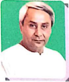
NAVEEN PATNAIK Chief Minister, Odisha